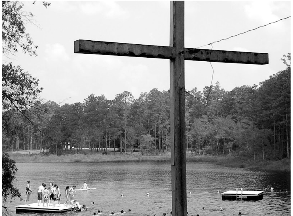
Cross at Blue Lake Camp