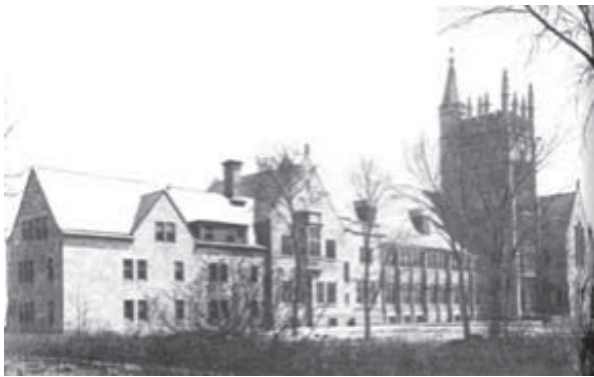
Original Garrett Biblical Institute

The next meeting of the Historical Society of The United Methodist Church and the North Central Jurisdiction Commission on Archives and History will be Monday, July 20, through Thursday, July 23, 2015, at Garrett Evangelical Theological Seminary in Evanston, Illinois.