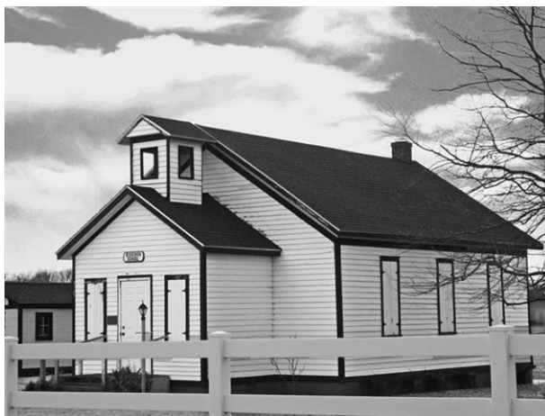
The Rosebud Schoolhouse