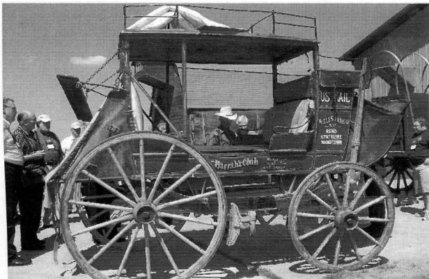
Stagecoach at Hansen Wheel and Wagon.